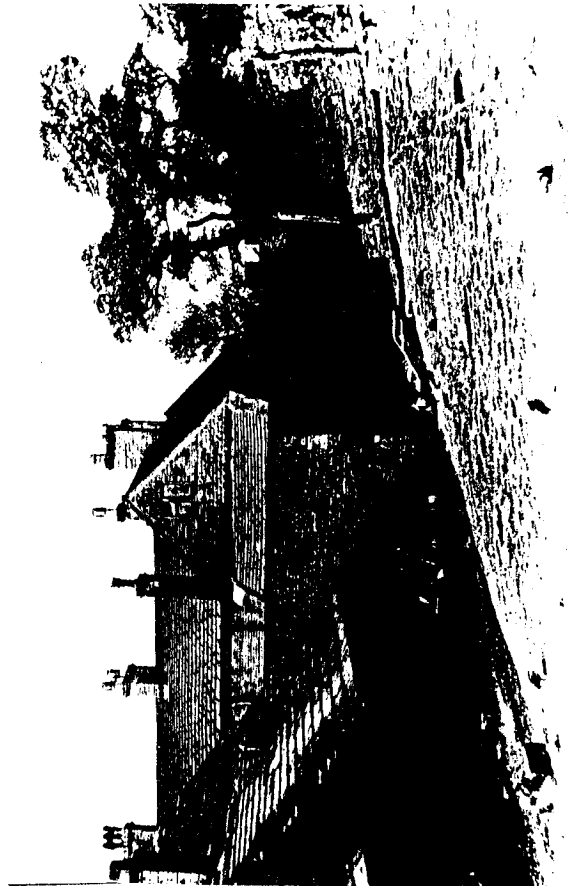
Unflattering look from the rear showing the added buildings, farm implements and a few skinny looking chickens.

HOLLINGWORTH HALL COLLECTION OF THE LATE FREDERIC ATTWOOD, HUSBAND OF GLADYS HOLLINGSWORTH OF THE COUNTY WEXFORD, IRELAND FAMILY. (SEE HR