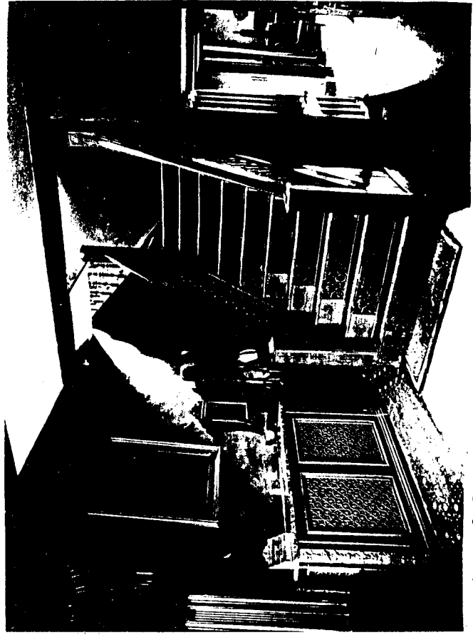
Interior of front portion devoid of the "great antlers" of long dead stags said to have once adorned it.