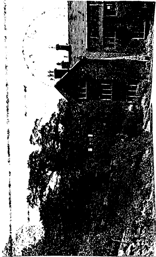
Closeup of Hollingworth Hall showing slope of hill, chimneys and ivy covering the old farm house.