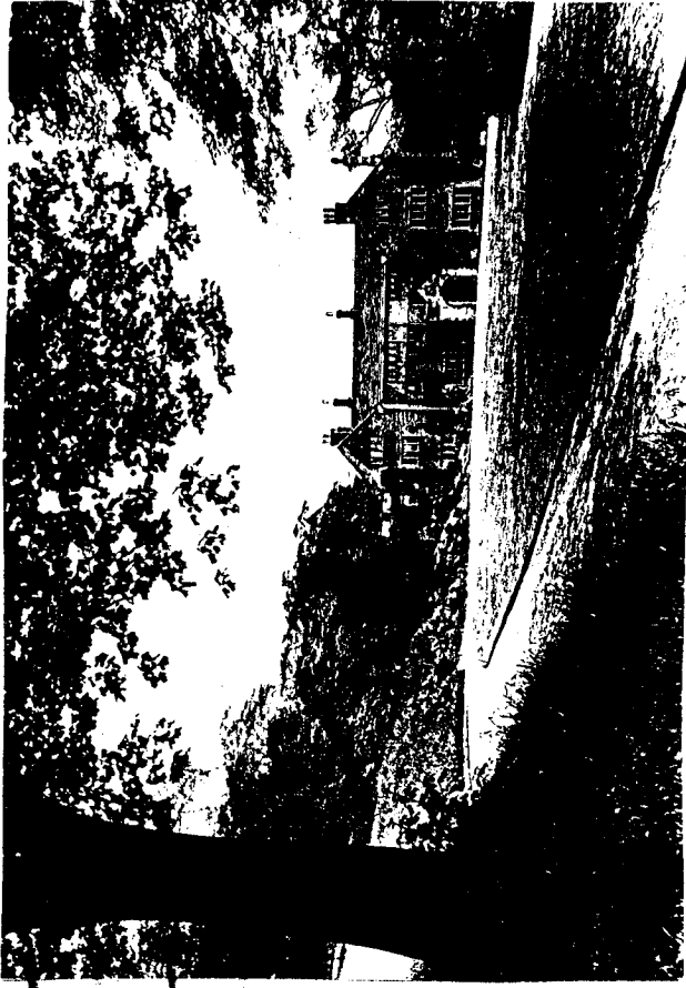
Distance shot showing portico with coat of arms over the door. House much the same as in Stewart's 1925 book.