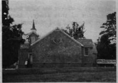
This is the third building built after the 1942 fire. An educational building has since been added to the left of the church.