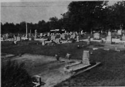
View of cemetery. Many Hollingsworths and related kin are buried here. Aaron & Ruth Hollingsworth are buried here.