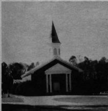
The present church

LIBERTY SPRINGS PRESBYTERIAN CHURCH , Cross Hill, S.C. Laurens, Co. A brief history of this church is found p. 1-5, Section II.