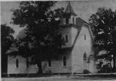
This is the second building used by the congregation. It burned to the ground on Feb. 10, 1942.