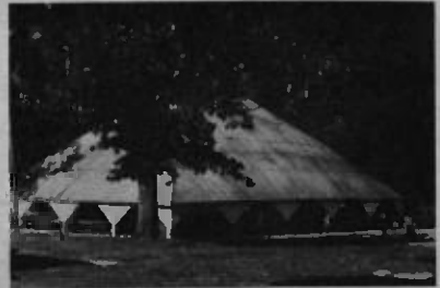
Tabernacle at Smyrna Campground. The church is presently engaged a drive for funds for a permanent roof.